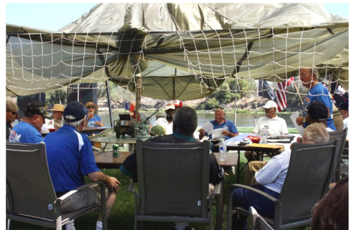
Chapter 10 Sky Soldiers conduct their meeting under a T-10 canopy